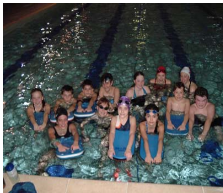
Some of our current swimmers who train with Aqua Swimming Club.

Our aim is to develop swimmers to an elite level preparing for competitions. We believe that to develop swimmers to their maximum potential, group numbers should be kept small, increasing the time coaches can spend supporting each swimmer. This will include analysing technique and fault correction, drill work and advanced swimming practices and specific level.